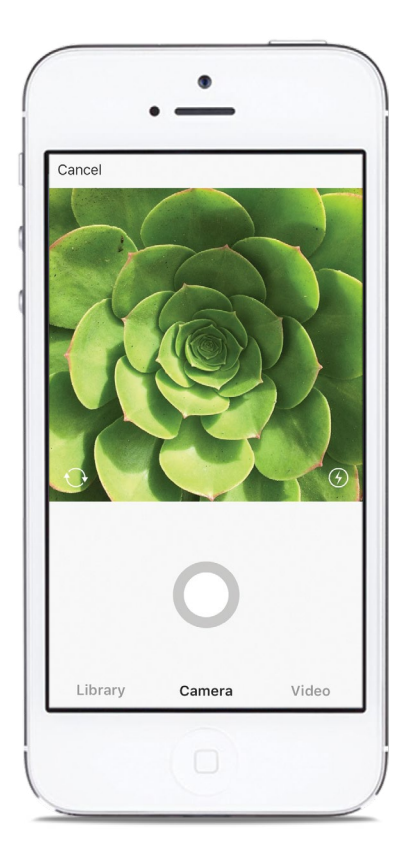
Instagram lets you shoot video or still images.

If your kids are using Instagram, the best way for you to learn about how it works is to ask them how. Kids are often glad to teach their parents about their favorite tech tools, and asking them about Instagram is not only a great way to learn about the app itself but also about how your children interact with their friends in social media. That's very individual, which is why we suggest you ask them about it, but if you want a little general information about using and staying safe in Instagram, here goes: